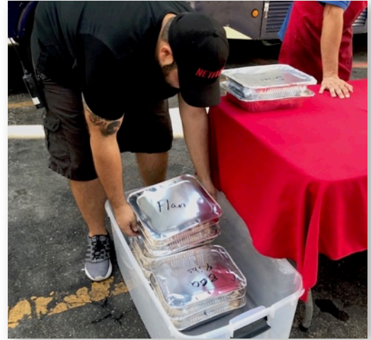
EcoSet donated unserved food directly to a non-profit after crew lunch service.

80 lbs of surplus catering food was delivered by EcoSet to Union Rescue Mission in downtown Los Angeles. LA is experiencing a homelessness crisis, and this donation contributed to the non-profit's efforts to combat hunger.